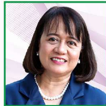
LUZ FILIPINAS S. SAN PEDRO Metal Engraving